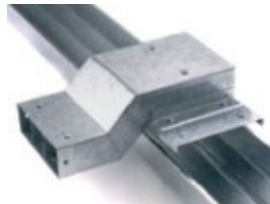
O/S Tee Off set tee