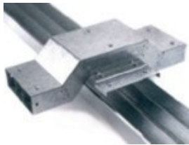
O/S CO Off set Crossover