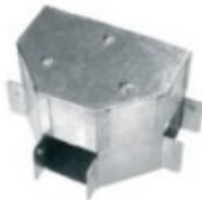
D/D Tee Full depth Tee