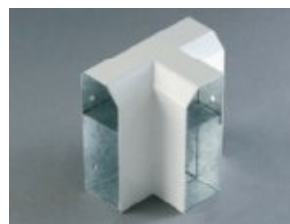
IST/LH Internal tee left hand