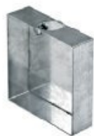
SS/SB Back Box