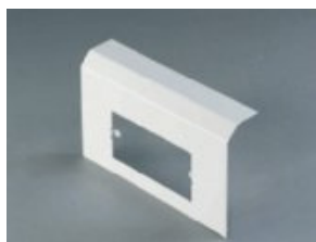
TSO Twin socket lid