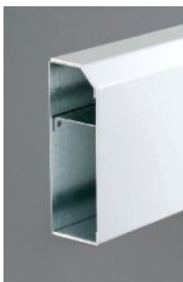
CD62/2C 150mm x 50mm (2 compartment) top 50mm, bottom 100mm