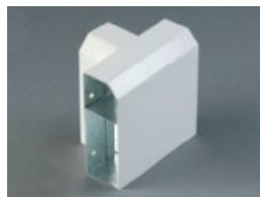
EST/LH External tee left hand