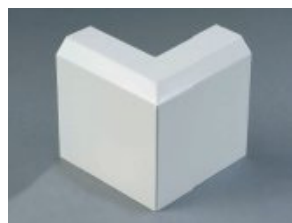
ESB External Bend