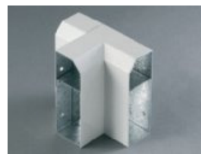
IST/RH Internal tee right hand