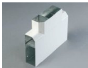
FST/LH-U Flat tee left hand (upward)