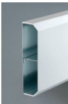
DCD82/2C 200mm x 50mm (2 compartment) top 100mm, bottom 100mm