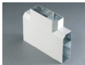
FST/RH-U Flat tee right hand (upward)