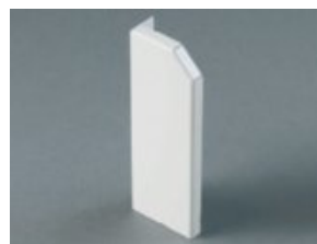
EC/LH End cap left hand