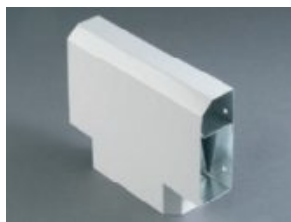
FST/D Flat tee (downward)