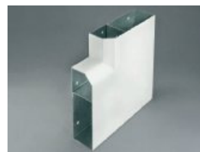
FSB/U Flat Bend (upward)