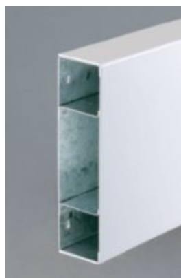
SD82/3C 200mm x 50mm (3 compartment) top 50mm, centre 100mm, bottom 50mm

Flytec dado trunking is supplied in 2 metre lengths. Manufactured to the same high quality as our skirting trunking it is designed to be installed around the perimeter, above floor level, thus allowing optimum use of floor space.