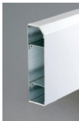
CD82/3C 200mm x 50mm (3 compartment) top 50mm, centre 100mm, bottom 50mm