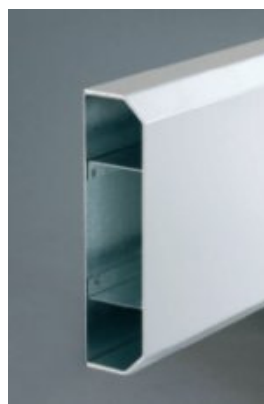
DCD82/3C 200mm x 50mm (3 compartment) top 50mm, centre 100mm, bottom 50mm