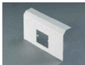
SSO Single socket lid