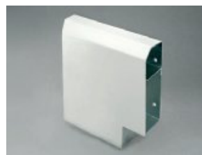
FSB/D Flat Bend