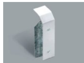
STRAP Additional cover strap