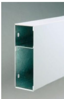
SD62/2C 150mm x 50mm (2 compartment) top 50mm, bottom 100mm