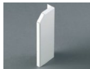
EC/RH End cap right hand