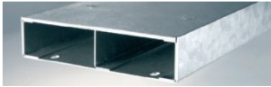
2 Compartment Flush D1/615/2C Size 150 x 38 D1/62/2C Size 150 x 50

We recommend that Flytec flush floor trunking is installed on a ribbon screed or similar to ensure support along the entire length and width of the system.