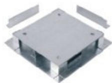
ASL Angle junction box