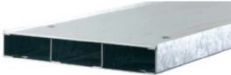
3 Compartment Recessed D2/915/3C Size 228 x 38 D2/92/3C Size 228 x 50