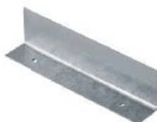
EC Stop end