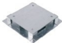
ASX Crossover junction box