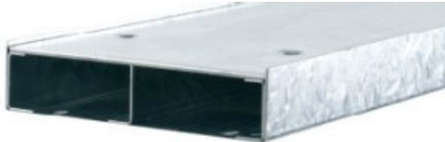
2 Compartment Recessed D2/615/2C Size 150 x 38 D2/62/2C Size 150 x 50