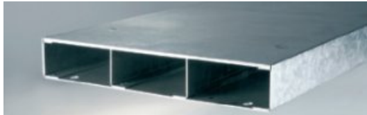
3 Compartment Flush D1/915/3C Size 228 x 38 D1/92/3C Size 228 x 50