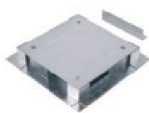
AST Tee junction box