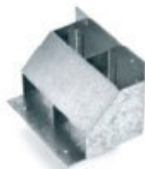
ISB Riser bend